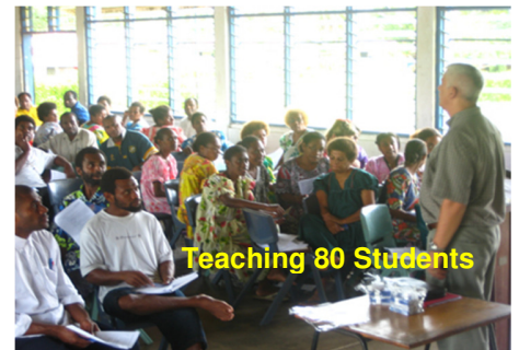
Teaching 80 Students

It started a couple weeks earlier when a Korean speaker had addressed the staff and students about the serious 10% decline per year in church membership that has been happening in the country over the past three years. They were shaken up and looking for a way to turn the situation around. That's why the director of Talua cancelled all other classes and activities during the week and made it mandatory that every student, faculty member, and administrative staff member, attend OUR training on how to lead people to faith in Christ and follow them up. I wonder if God orchestrated this because of a prayer that you prayed.